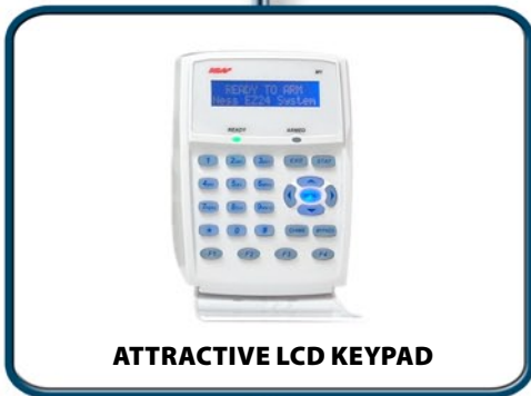
ATTRACTIVE LCD KEYPAD

24 ZONE ALARM PANEL EXPANDABLE UP TO 200 ZONES